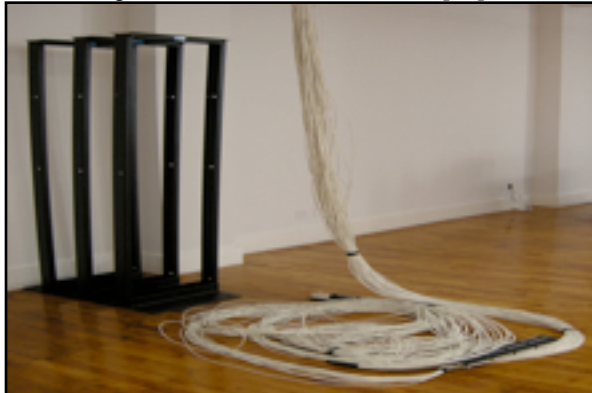
Figure 3. Data Center

"The Information and Communications Technology sector accounts for nearly 2% of global greenhouse gas emissions, and that data centres account for 23% of the direct footprint of the sector." -- Gartner [10]