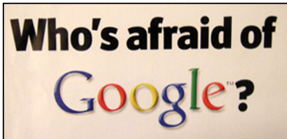
Figure 1: Economist Cover, September 2007

As our identities and activities become wed to software systems, developers have begun to affect our lives in ways and to degrees we hadn't anticipated.