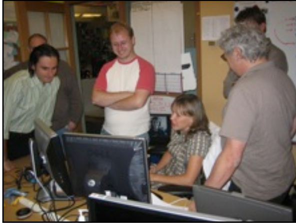
Figure 4: An agile development team

the Manifesto for Agile Software Development . The manifesto consists of a preamble and a list of twelve principles.